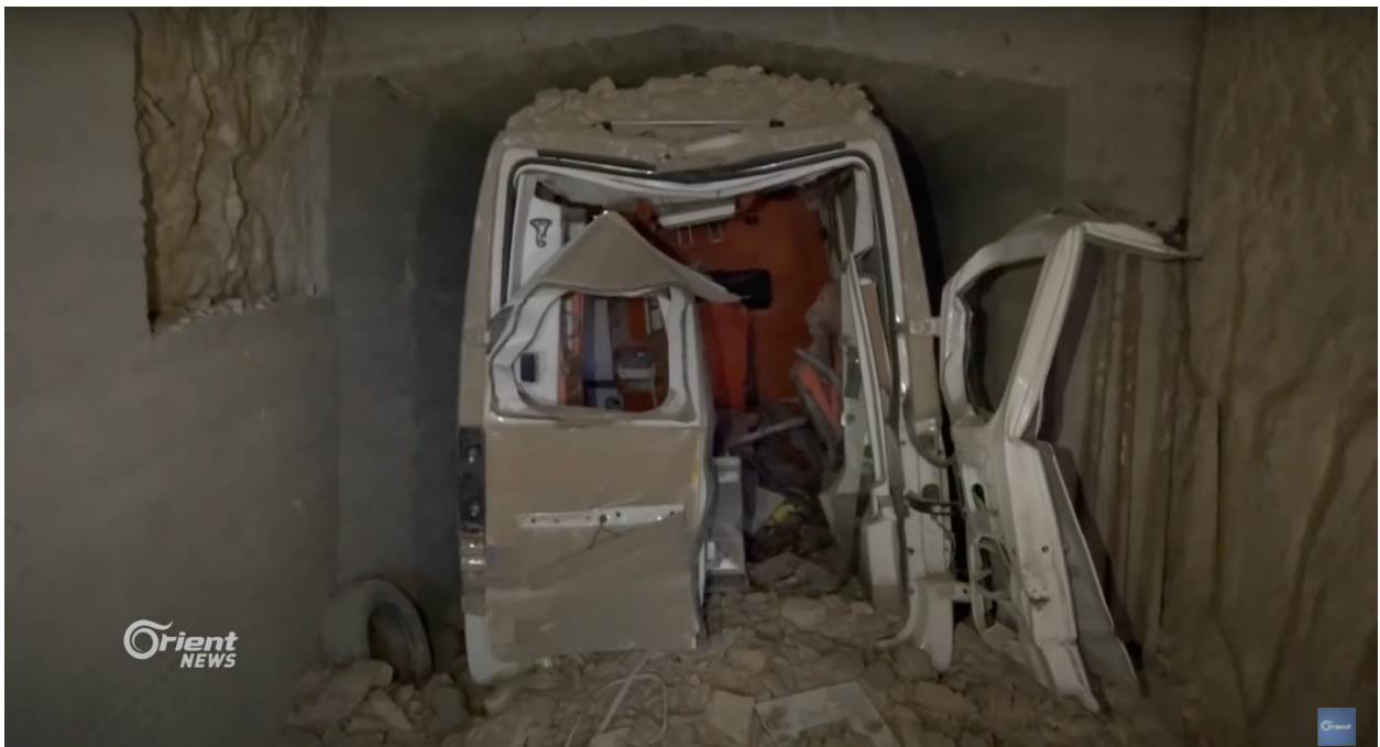
Inside Al Rahmeh Hospital after Russian Forces hit the facility with airstrikes days after a chemical weapons attack nearby.

Lastly, on February 8 in Khan Sheikhoun—50 km south of Saraqib—Russian Forces hit the Al Rahmeh Hospital and neighboring Civil Defense center. Also situated directly along the M5, the facilities were hit