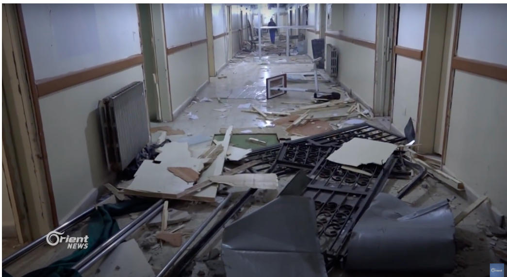
The inside of Maaret Al Numan National Hospital after Russian Forces struck the facility on February 4, 2018.

The same day of the attack, 25 km south of Saraqib in the city of Maaret Al Numan, Russian Forces hit the Maaret Al Numan National Hospital by airstrike. Given that the attack was a direct hit and the hospital had been attacked at least six times before, Syrian Archive identified this medical facility as deliberately targeted. The Maaret Al Numan National Hospital is situated in a strategic location directly along the vital M5 highway. These characteristics of the attack suggest potential intent in attacking the medical facility the same day as a nearby chemical weapons attack.